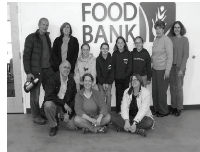
Hancock members at the Greater Boston Food Bank after packing food for the BackPack Program

Look by the church office and in the narthex for posters, drop-off boxes, and lists of the specific items needed. Help